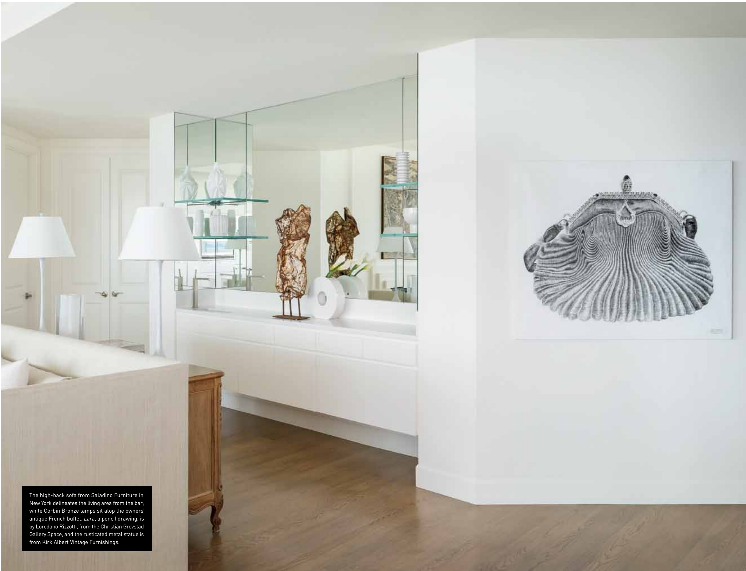
The high-back sofa from Saladino Furniture in New York delineates the living area from the bar; white Corbin Bronze lamps sit atop the owners' antique French buffet. Lara , a pencil drawing, is by Loredano Rizzotti, from the Christian Grevstad Gallery Space, and the rusticated metal statue is from Kirk Albert Vintage Furnishings.